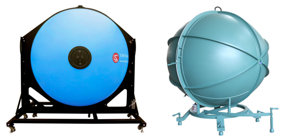
A Molding Integrating Sphere VS the traditional Integrating Sphere

Due to the LED luminaries such as LED street luminaries developed, to do 4\pi geometry testing, it is hard to be hold in the traditional integrating sphere design. To solve this problem, LISUN design a new kind of sphere.