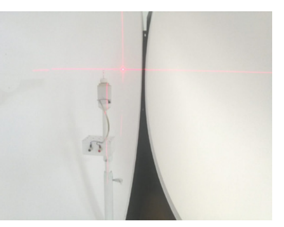
Build-in Cross Laser System