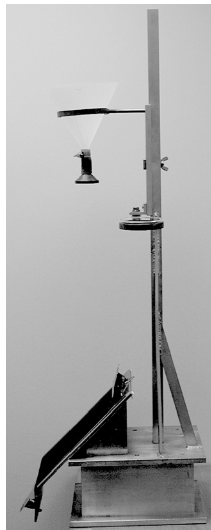
Fig. 2—Impact penetration Type II tester.

5.1.2 Type II tester (see 11.1, Figs. 2, 3 and 4)