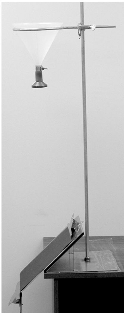
Fig. 1—Impact penetration Type I tester.

5.1.1 Type I tester (see 11.1, Figs. 1, 3 and 4)